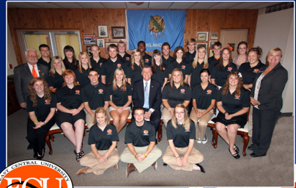
Congressman Tom Cole ♦ September 1, 2011

Hundreds of visitors were on campus as ECU hosted the Chickasaw Nation National Night Out in August.